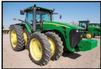
2010 JOHN DEERE 8345R 2775 Hrs, IVT, ILS, AT Rdy, HDS. .... $214,500 L