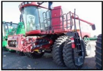
2009 CASE IH 8120 879 Hrs, Axial Flow, Lat Tilt HD FH, Chopper ..... $203,000 C