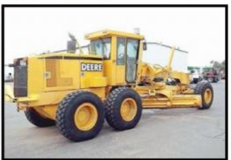
'00 JD 772CH AWD Grader 5500 Hrs .... ..... $96,500 G

This is a partial listing of our equipment. We have an excellent selection of hay, planting, drilling and tillage equipment. Visit our website or call today!