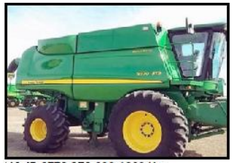
'10 JD 9770 STS 300-1200 Hrs. .... ..... fr $176,500 G,H,S,W