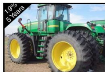
'11 JD 9230 PS 600 Hrs .... $207,000 U