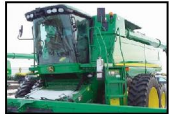
'11 JD 9770 STS, 708 sep. prem cab, CM, ext wear, duals. .... $221,000 L

Now With 10 Locations To Best Serve You 0.9% for 4 Years on Sprayers w/ 500+ Hrs (ends Dec 31st)