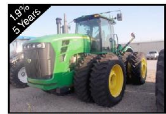
2009 JOHN DEERE 9330 2433 Hrs, 18/6 PS, AT Rdy, Difflock F&R .... $215,000 R