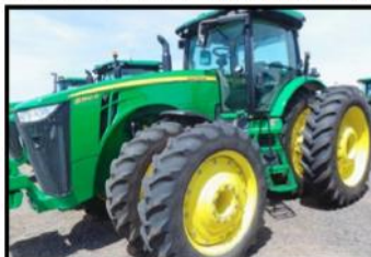
'11 JD 8360R, 529 hrs, IVT, ILS, A/T Ready, Cat4 3pt, HDS. .... $269,500 O