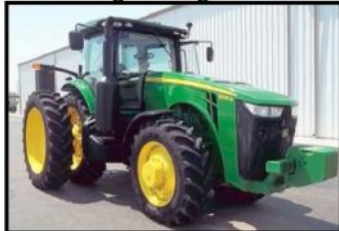
'12 JD 8235R, ILS, MF, 600-1500 Hrs. ..... fr $151,000 EGHSU

0% for 5 years on Combines w/ 500+ Sep. Hrs (WAG)