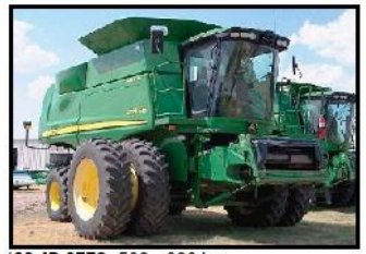
'08 JD 9770, 500 - 900 hrs ..... ..... fr $182,500 GSEW